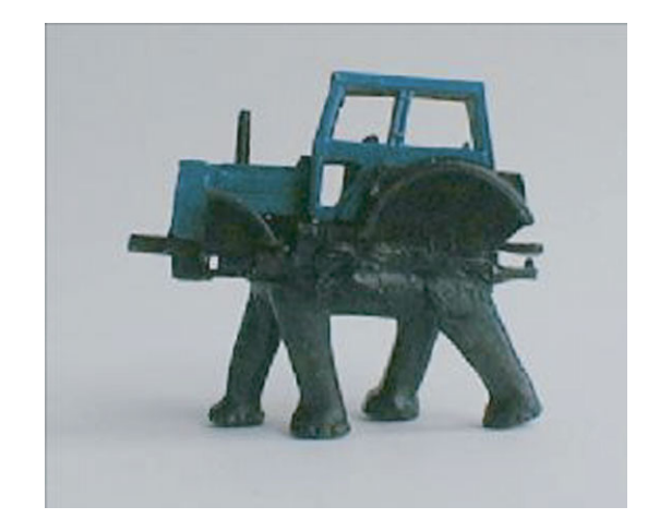
FIGURE 2 | Example of stimulus used by Rakison and Butterworth.<sup>51</sup> Infants at 14 and 18 months of age categorized such stimuli on the basis of their parts (e.g., legs).

In this procedure—also known as generalized imita tion —the infant is first provided with two or more